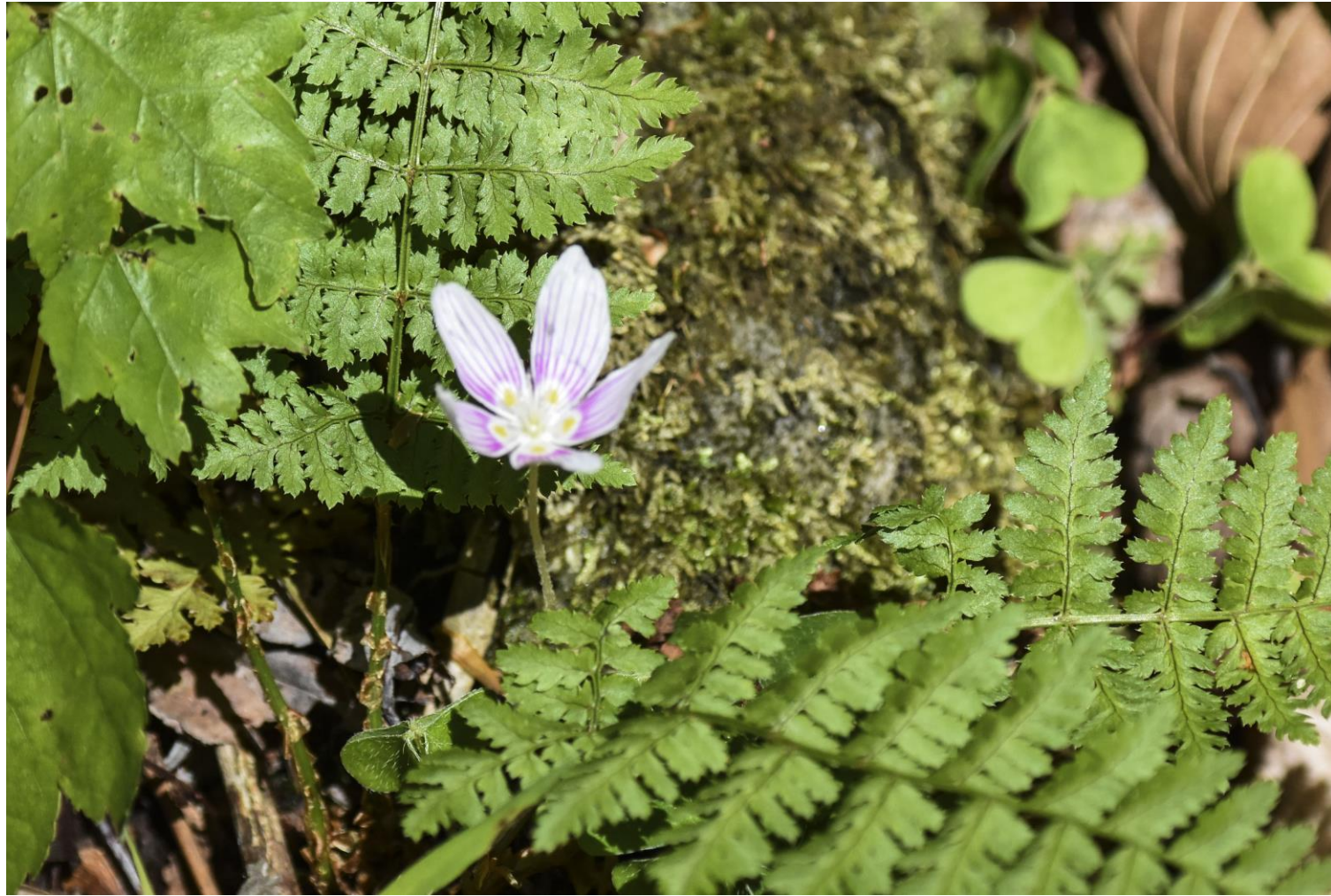
Common Wood Sorrel