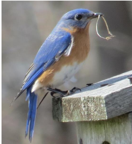
Eastern Blue Bird