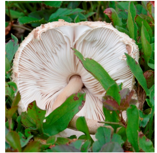
Don't forget to look at the mushrooms this season.

Rarely seen moths, butterflies, and flying insects are active at night. To view them, we erect a special light that entices them. A white sheet spread around the light makes for easy viewing. Bring flashlights, cameras, insect guides (or smart phones) to view, photograph and identify what shows up. The variety will change with the seasons. Dates and locations will be announced on the website news feed.